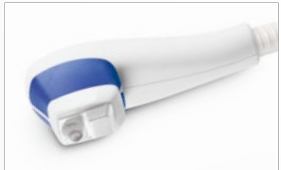
Spot size: 0.48 cm 2

Patients with darker skin types and very fine hairs can be very difficult cases to deal with. The High Power handpiece offers the possibility to treat this condition with highest effectiveness and completely safely, thanks to the diode technology reaching up to 90J/cm 2 with very short pulses.