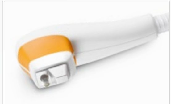
Spot size: 0.12 cm 2

MeDioStarNeXT goes beyond just hair removal, with versatility and user-friendliness in other applications, such as the treatment of leg veins , hemangiomas and other ectatic vessels. With the special vascular handpiece featuring a wavelength of 940 nm, it allows non-invasive and fast treatments, usually with no need for an anesthetic.