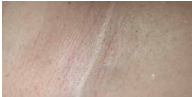
After 3 treatments

densities, the application is always safe, guaranteeing low risk and a gentle treatment for patients. The very low risk of side effects is achieved through an homogeneous spot profile and very efficient cooling of the epidermis. The unique fiber taper technology guarantees the flat top profile of the spot without hot spots. Simultaneously the skin surface is cooled with the integrated peltier element, which makes the treatment much more comfortable. With the new Smooth Pulse mode for large areas a treatment speed up to 12 Hz provides the fastest application.