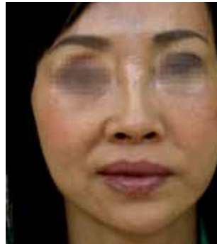
After 1 treatment