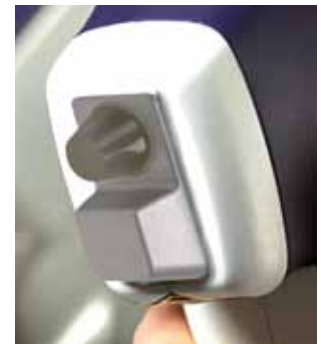
High Power handpiece