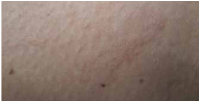
After 1 treatment